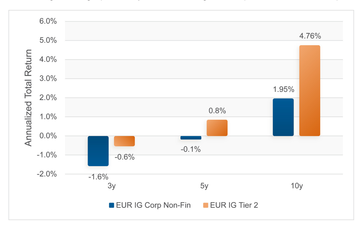
Chart 3: Over the longer term, high spreads and yields have driven significant outperformance of sub debt corporates.

While the analysis refers to non-green bonds (green bonds currently make up a very limited portion of both indices), including a potential greenium of around 5bps would not have made a material difference. To illustrate this, the tenyear annualized total return of the EUR IG Tier 2 index after applying a static 5bps greenium would have been 4.71% compared to 4.76% without a greenium, compared to 1.95% on EUR IG non-financial corporate bonds.